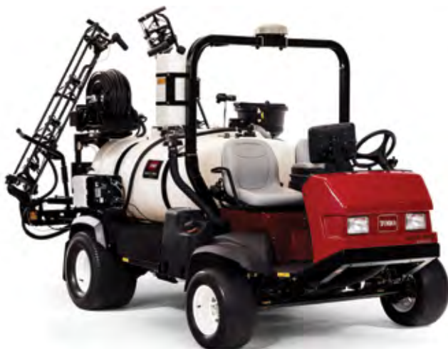
Multi Pro® 5800 Sprayer