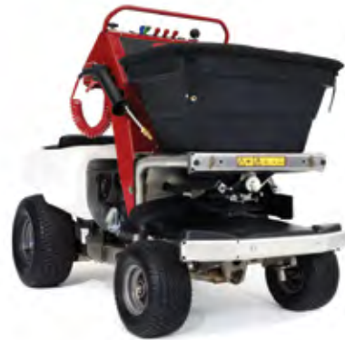
Stand-on Spreader Sprayer