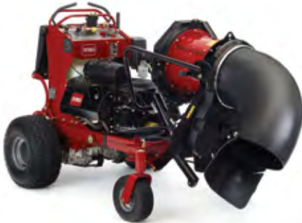
MultiForce with Pro Force® Blower