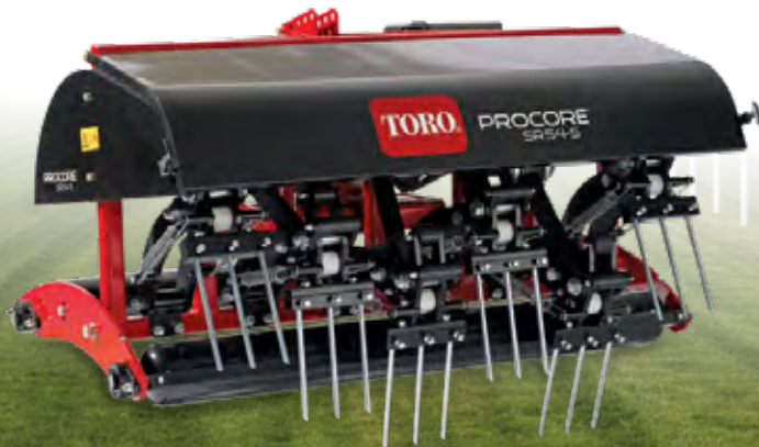
ProCore® SR Series Deep-Tine Aerators

Healthy turf depends on managing compaction and ensuring the proper amount of air, water and nutrients can reach the roots. From aerators to topdressing equipment, Toro has everything you need for a comprehensive cultivation program to ensure the health and vigour of your turf.