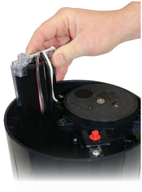
Toro INFINITY® sprinklers can be ordered with integrated LSM modules.