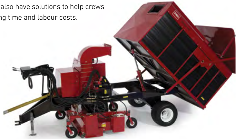
Versa Vac Sweeper