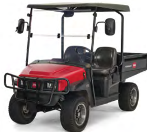
Workman® GTX Lithium

The Outcross® 9060 is an invaluable tool in the long-standing battle Grounds Managers face to "do more with less." This machine is a time-saving, easy-to-use, multi-purpose, turf-friendly workhorse that brings year-round flexibility, consistency and productivity to turf maintenance operations. Get ready to do more.