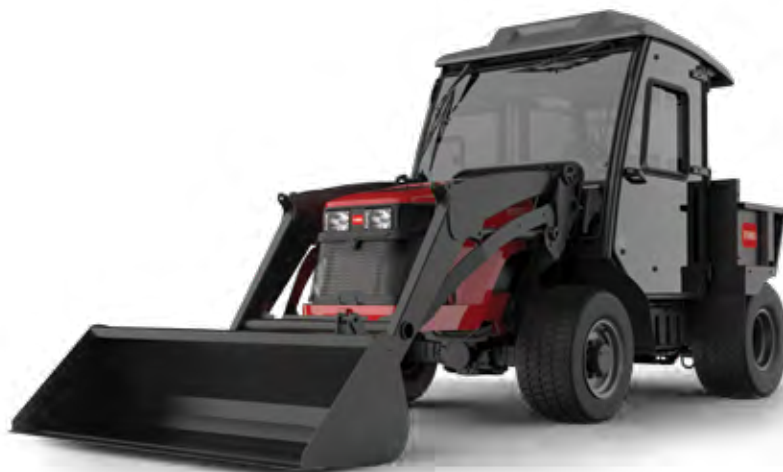
OutCross® 9060 All-Season Cab with loader arms and bucket