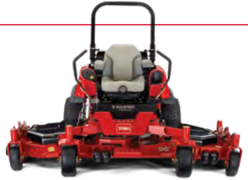
Z Master® 7500-D Series

Groundsmaster® wide-area mowers help you do more with less, covering larger areas effortlessly. But don't let the rugged appearance fool you. These mowers are surprisingly nimble and offer the ability to mow a zero uncut circle for maximum productivity. With cutting widths up to 488cm, you can mow over 8 hectares/hr.