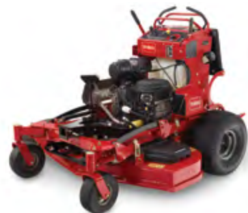
GrandStand® MULTI FORCE®