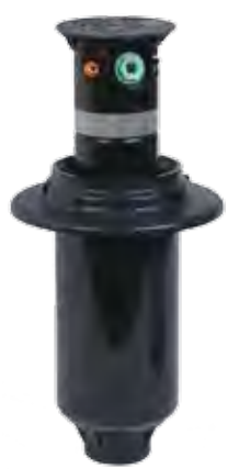
FLX34B and FLX35B

Main Nozzle Adapter A wide assortment of intermediate and inner nozzles for use in the main nozzle adapter and back nozzle position provide unmatched nozzle flexibility.