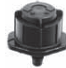
Mini Bubbler Thread 4mm