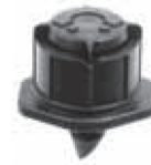
Mini Bubbler Barb 4mm