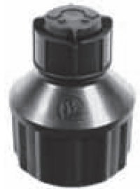
Mini Bubbler Thread 1/2"