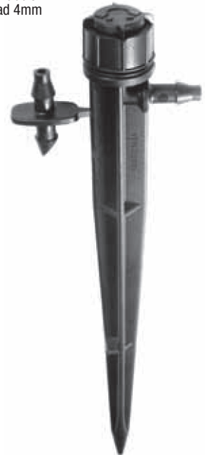
Mini Bubbler Spike 4mm