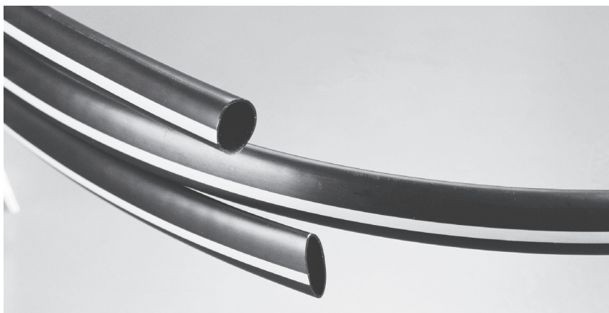
Dura-Pol™ tubing is a layflat form of tubing and is used in portable drip irrigation systems where the tube needs to be re-located or re-used.