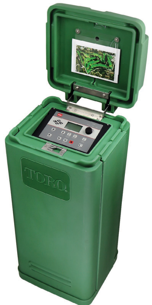
Lynx ® Smart Satellite

Station-Based Flow Management, current sensing and alarm response, runtimes to the second, Group Multi-Manual operation, Basic/Advanced/Grow-In programs.