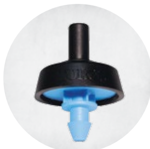
Male Adaptor Outlet